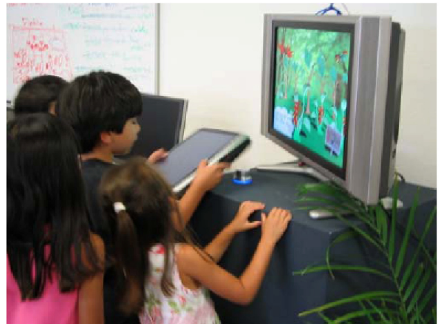
Fig. 2. Children transferring a hummingbird from the collecting box (i.e., tablet PC) to a virtual island.

For example, the behavior of an individual hummingbird is the product of a suite of ecologically relevant variables that include its unique natural history, the availability of food resources, and the time since it was last fed. (To enhance interaction between user and system, the amount of human activity in front of the display screen also influences hummingbird behavior. This is accomplished by equipping monitors with motion sensors that detect the presence of a nearby observer. Detection causes the hummingbird to approach the screen, creating the illusion that the hummingbird